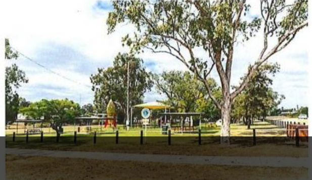
Moura Lions Park