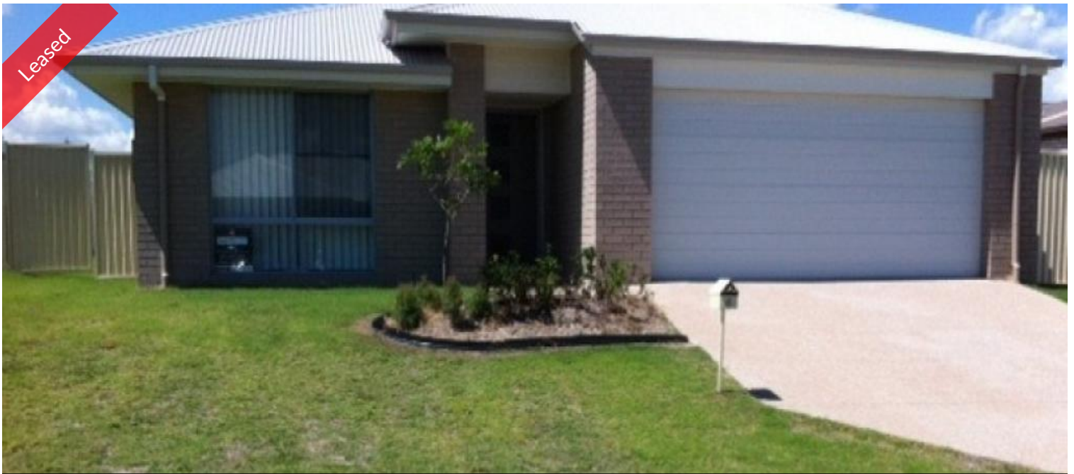
4 Hayden Place, Moura