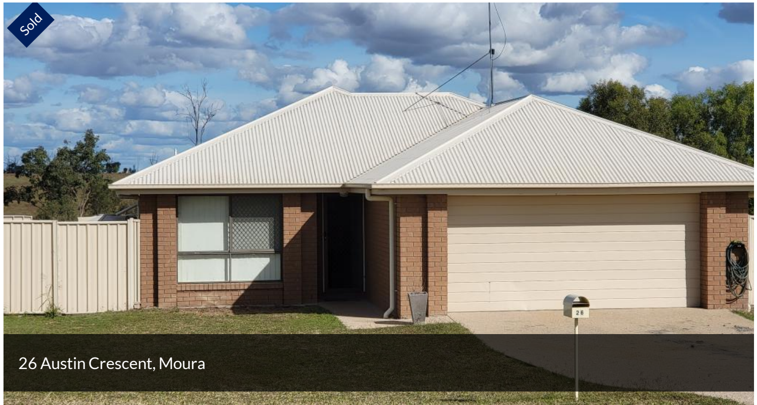
26 Austin Crescent, Moura