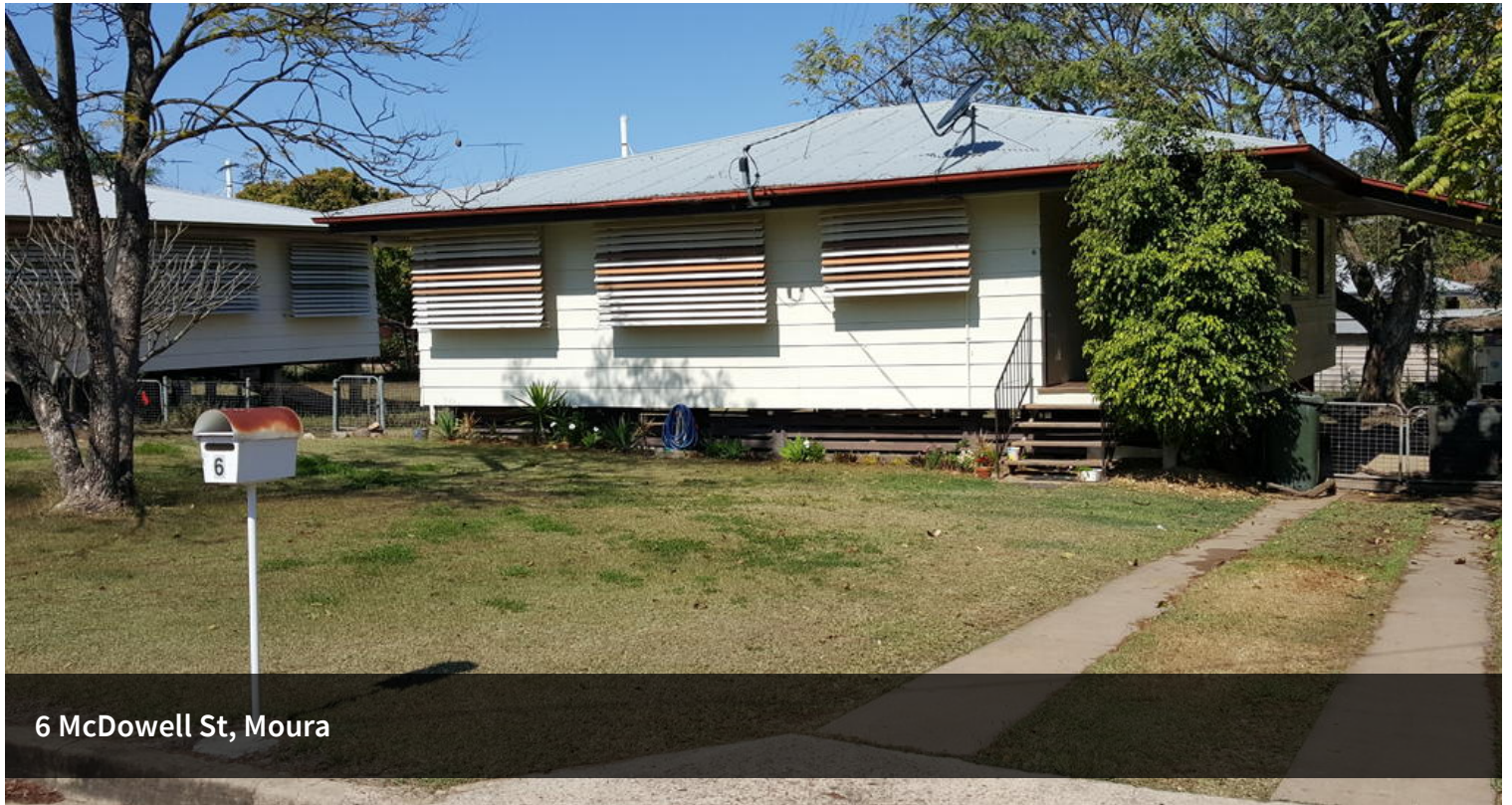
6 McDowell St, Moura