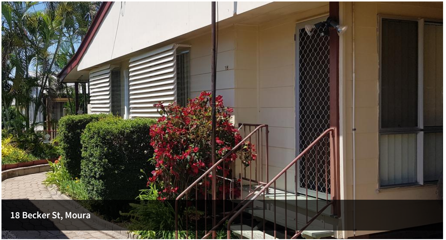
18 Becker St, Moura