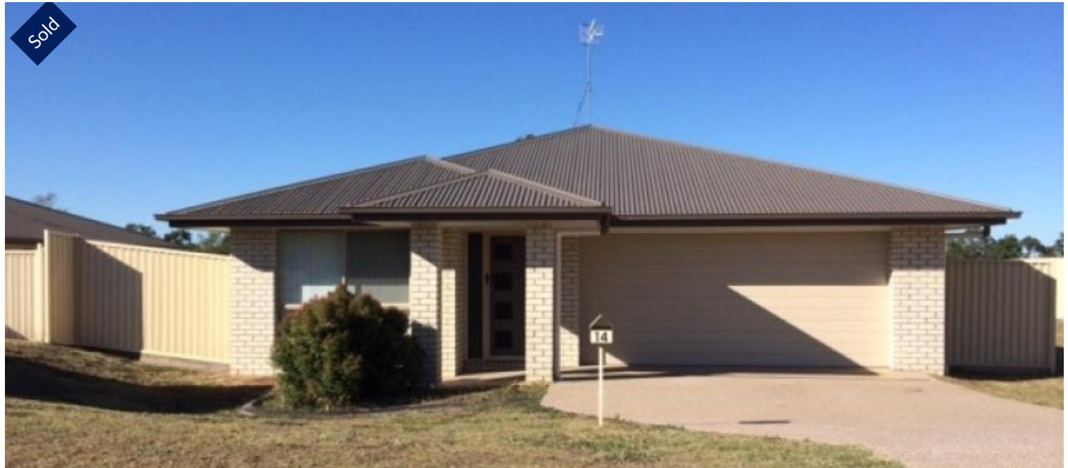
14 Austin Crescent, Moura